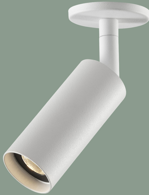
VIS C1S - 4.5 cm (1.77'')