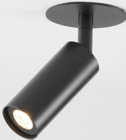
VIS C1S - 6 cm (2.36'')